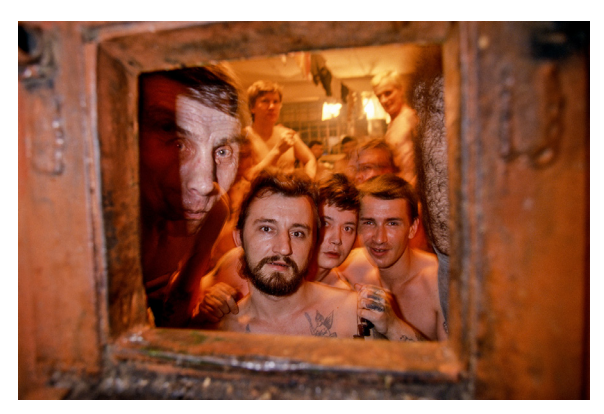
image 5 The Cross - Prison, St.Petersburg, 1991 Problems are locked away.

Particularly dangerous prisoners, members of the notorious St. Petersburg gangs, they looked curiously from behind the a flap in the cell door during the distribution of their lunch. The St. Petersburg remand prison "IZ 45/1", called "The Cross", was already built during the time of the Tsars on the banks of the Neva. The prisoners in hopelessly overcrowded cells sometimes wait years for a trial.