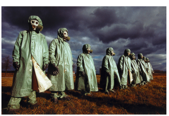
image 4 Practising for the end of the world, Moscow, 1990 Soldiers of the "Kantemirov" elite division were exercising atomic, biological and chemical warfare. Western journalists were proudly presented the finely turned out "Guards Tank Brigade" near Moscow. In many other units, however, sometimes the recruits had to go hungry.