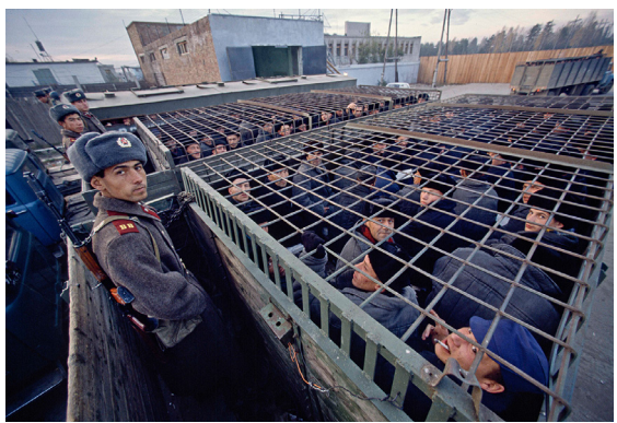
image 3 The Human Cage - Station Sima, Trans-Siberian Railway, 1989 Early morning transport to work in the penal camp No. 272/32, Sima station, on the Trans-Siberian Railway. Category: "Strict regime". Those who are released, after ten or fifteen years in the camps, have nowhere to go and nowhere to stay and have no chance of finding real work. Almost all of them return sooner or later.