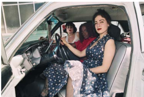
The Mission, 1996

https://www.dropbox.com/scl/fo/coz11a3hoojtsbrue91jm/h?dl=0&rlkey=4gynzm6bs41n6cgzft9qz69q