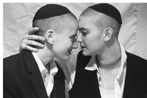
Kindred Spirits, 1994 © Chloe Sherman