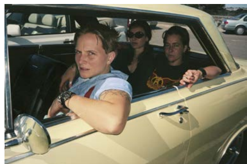
In My Chevy Nova, Ace Driving, 1997 © Chloe Sherman