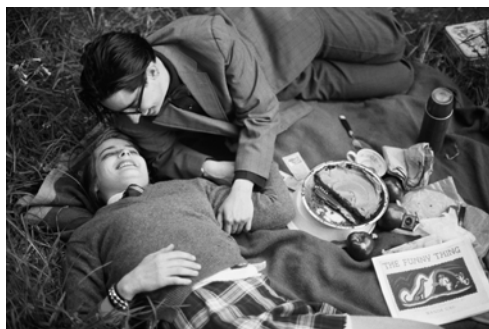
Picnic near Mission Dolores, 1996