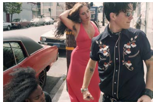
The Heist, 1996