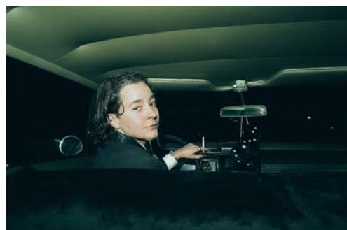
View from the Back Seat, 1997